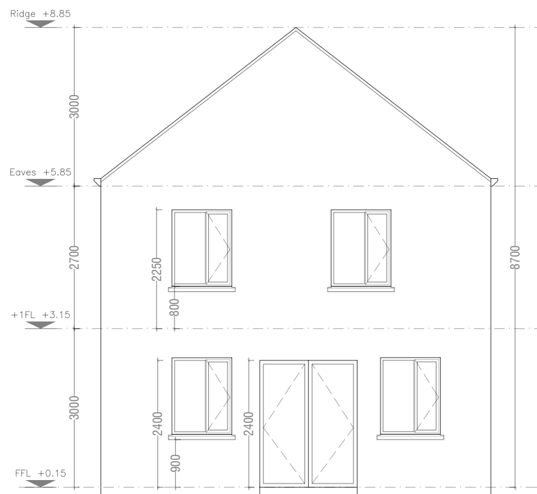
House Type M2 Detached Rear Elevation

Do not scale this drawing, only stated dimensions to be used. All dimensions to be checked on site. Only drawings marked for construction are suitable for this purpose, all others are only suitable for the use indicated. This drawing is protected by copyright and is the property of JFOC Architects. Any disclosure, copying, reproduction or distribution of this information without written authorisation is prohibited and will be deemed a breach of copyright.