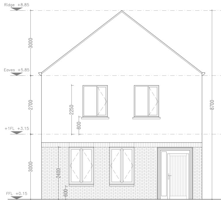
House Type M2 Detached Front Elevation